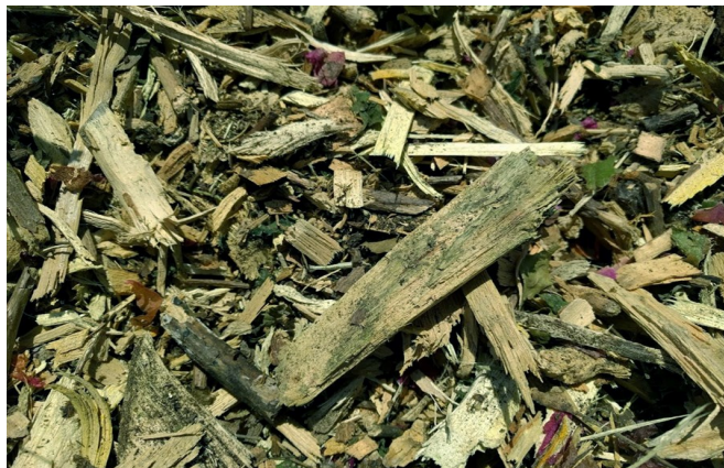
Fig. 2. Fresh wood chips become infected with Trichoderma spp. over time.

Targeted or classical biological control seeks to “inoculate” or “inundate” the environment with parasitic or predatory organisms respectively. Curiously SMDC does not require inundative releases of biological control agents. If the substrate for microbial growth is in place, biocontrol fungi can develop on those particles and impart their disease suppression to the media. For this reason, media made of stable materials such as pine bark or peat moss may be less likely to support growth of biological control agents than more labile components such as fresh wood chips.