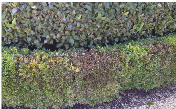
Fig. 1. Darkened, purplish discoloration of the foliage caused by boxwood blight.

The disease is primarily spread by transporting contaminated plant material (plants, decorative boxwood greenery), but spores can also be spread