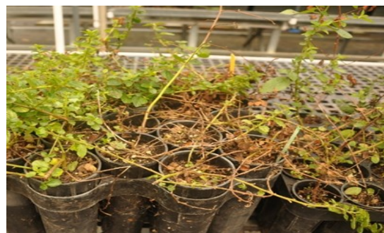
Fig. 1. Ceanothus thyrsiflorus infested with Phytophthora sp. pathogens in a restoration nursery.

caused by direct contact, for example following water movement or splashing of infested water or soil. The sporangia or zoospores of aerial Phytophthora species may spread short distances in air currents or with wind-driven rain. Root-rotting Phytophthora species on the other hand, mainly spread through soil and water movement only. Phytophthora species cannot be seen with the naked eye unless grown in culture in a laboratory. However, if fungicides do not suppress Phytophthora disease development, it is often possible to see visible symptoms on host plants (fig. 1). These symptoms are described in detail in our next feature article in this newsletter.