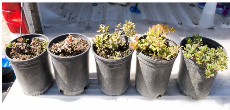
Fig. 6. Arctostaphylos uva-ursi with various degrees of aboveground symptoms; all have Phytophthora root rot (infected with several Phytophthora species).