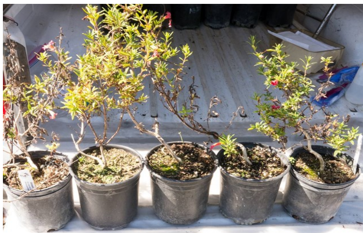
Fig. 4. Diplacus aurantiacus 'Trish' with various degrees of Phytophthora root rot (infected with Phytophthora cryptogea ).

Diseased roots can be reddish brown to dark brown while