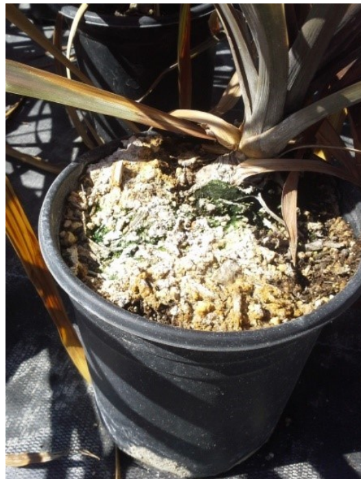
Fig. 1. Salt buildup up in a container receiving overhead irrigation with secondary water sources such as reclaimed municipal water or water sources high in alkalinity. Salts accumulate where wicking of moisture occurs from the media. In this example, evaporation occurs from the top of the container and on the inside on the southwestern side of the container (not shown). This will result in root dieback in these regions.