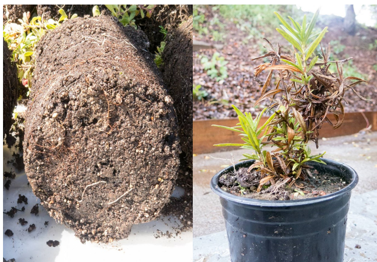
Fig. 8. Top right: Diplacus aurantiacus (sticky monkeyflower) with Pythium root rot (infected with Pythium cryptoirregulare ).

For these reasons, to gain identification for critical management decisions, it would be advisable to take disease samples to a professional plant pathology lab where cultures can be obtained and identified.