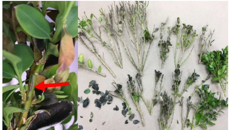
Fig. 4. Top right: Boxwood blight symptomatic stems and leaves.

resistance, but none are immune. The home gardener might prefer to plant boxwood alternatives such as cultivars of Ilex , dwarf Picea , Thuja , Taxus , Euonymus , Myrica and Myrsine Africana .