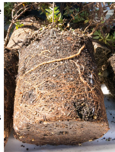
Fig. 5. Diplacus aurantiacus (sticky monkeyflower) with Phytophthora root rot (infected with Phytophthora cryptogea ). All fine feeder roots are infected and necrotic. Phytophthora has not killed larger roots yet.

Some of these are soil microbes that only break down already dead material, and