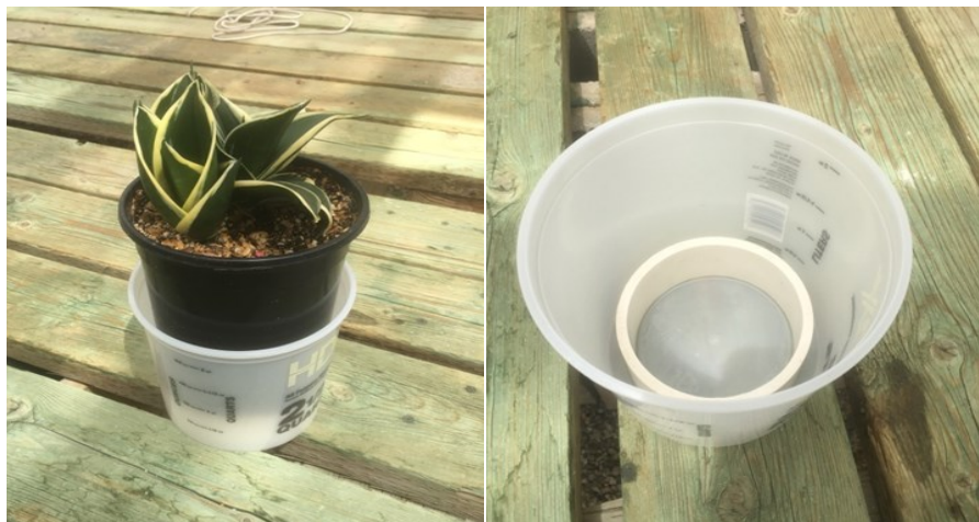
Fig. 3. Top left: A mother-in-law's tongue ( Sansevieria ) in a #1 pot placed inside a paint bucket to collect leachate.

Some key notes regarding the PourThru methods: