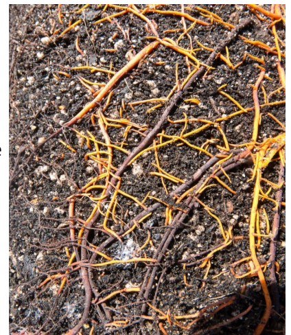
Fig. 3. Frangula californica (California coffeeberry) with necrotic roots infected with Phytophthora multivora .

Usually, however, when root rots are more moderate or severe, aboveground symptoms can include obvious stunting and shoot dieback. Leaves can be smaller than normal and have chlorosis or interveinal chlorosis.