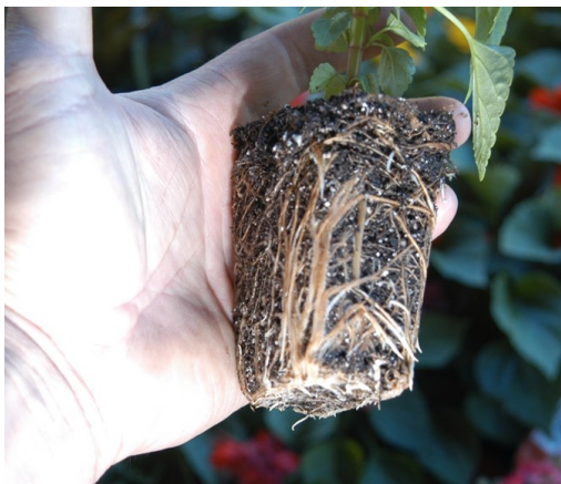
Fig. 1. Incipient root rot does not show on foliage but roots may be discolored.

Trichoderma is a wood-inhabiting fungus and preferentially grows and sporulates on fresh wood (fig 2). In my own experience and in observations from experiments that I conducted with other researchers, media lacking fresh wood chips may be less likely to sustain Trichoderma . For example, we observed increases of Trichoderma on fresh wood chips associated with concomitant loss of viability of Armillaria mellea inoculum incubated in piles of fresh yardwaste over time (Downer and others 2008).