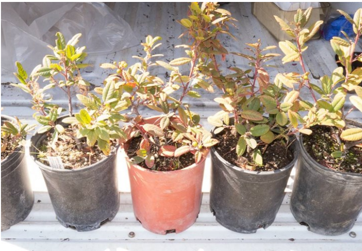
Fig. 1. Frangula californica (California coffeeberry) with varying degrees of Phytophthora root rot (infected with Phytophthora multivora ).

The expression and severity of Phytophthora crown and root rot depend on the particular plant host, Phytophthora species and environmental conditions. Some plant species limit infection and colonization of their root system resulting in the loss of just a small number of feeder roots. Limited colonization may only cause mild or even no apparent aboveground symptoms. There may be some limited plant stunting or leaf chlorosis evident when compared to healthy plants. However, there is not always a straight-line relationship between the aboveground symptoms (see fig. 1,4,6,8 for examples) and belowground infections (see fig. 2,3,5,7,9).