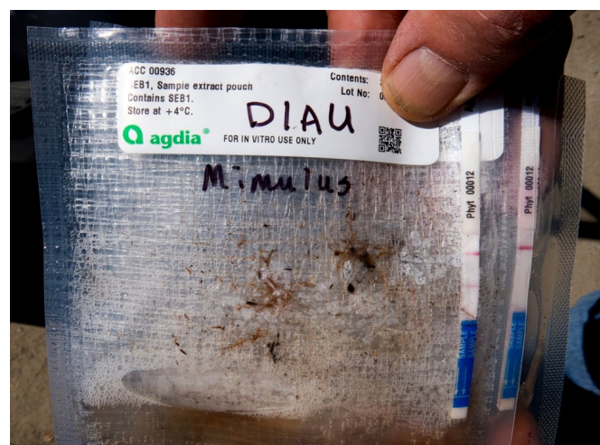
Fig. 10. Immunostrip test for Phytophthora. Symptomatic roots are sampled, macerated in a buffer test solution and pouch. The test strips inserted in the pouch indicate results in as little as few minutes. Test strips have a magenta-pink-colored “control line” indicating a valid test, as seen in both test strips here. If Phytophthora is detected, then two lines appear: a control line and a “ Phytophthora -discovered” line. You can see the latter line next to the red arrow on the strip to the left (although more weakly) but not on the strip to the right.