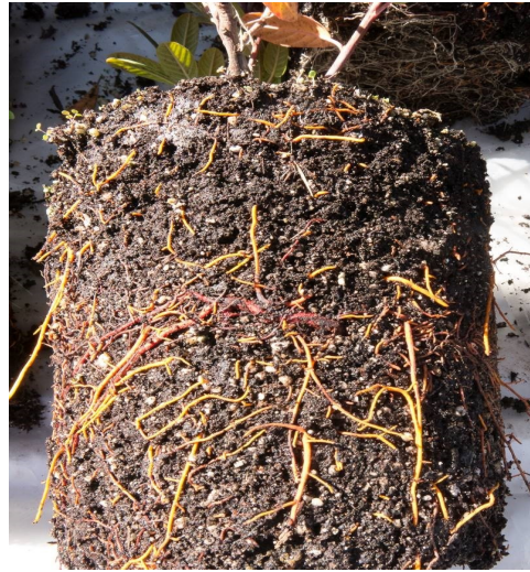
Fig. 2. Frangula californica (California coffeeberry) root systems are uniquely yellow to orange when healthy.

symptoms and actually the roots are quite infected. If unmanaged, these plants can act as cryptic sources of the pathogen and its infectious spores can spread to other plants.