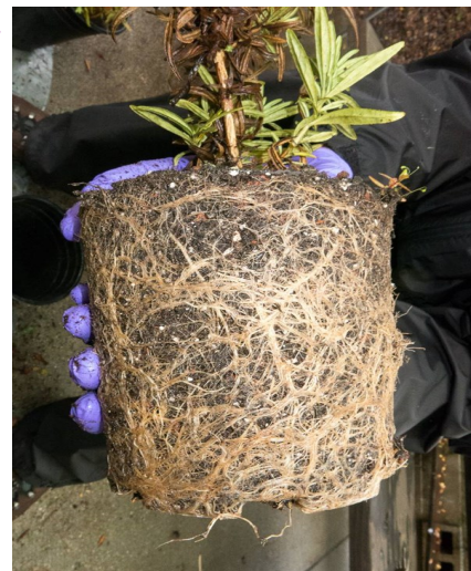
Fig. 9. Diplacus aurantiacus (sticky monkeyflower) with Pythium root disease symptoms (infected with Pythium cryptoirregulare ). Note the many light-brown water-soaked root regions and that this plant is also root bound. Poor root and overly wet conditions may have contributed to the unhealthy nature of this particular plant.

For these reasons, to gain identification for critical management decisions, it would be advisable to take disease samples to a professional plant pathology lab where cultures can be obtained and identified.