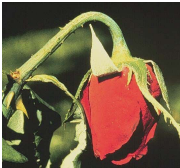
Problems with clogged and collapsing lignified cellulose pipes (xylem) shortens the vase life of cut roses.

Intractable problems with clogged and collapsing lignified cellulose pipes got me thinking about their role in shortening the vase life of cut flowers. Despite the absence of an orangeburg prompt, Li and others (2012) at Zhongkai University in China had something similar on their minds. To find out how bacteria affect vase life of cut roses, they isolated the dominant strains from the base of cut stems of 'Movie Star' roses, added known amounts of those bacteria to vase water and examined the effect on vase life. They also tested the efficacy of an antibacterial agent, nanosilver. Nanosilver materials, which contain nanoscale silver particles (5 to 50 nanometers in diameter, so you could line up about a million of them per inch, if you were patient enough), have been shown to inhibit bacterial growth. The rose researchers isolated four dominant bacterial strains and found that all are capable of plugging xylem, the water-conducting tubes in plant stems. An initial bacterial concentration of 100 million colony-forming units per milliliter of vase water caused cut roses to lose fresh weight because water loss from transpiration exceeded the capacity of the partially plugged stems to conduct