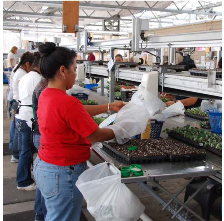
A well-designed employee selection process is critical to determining information about a candidate's skills.

The table on the next page lists various selection tools that can be used for measuring specific skills, knowledge and abilities. In selecting which tools to use, it may be helpful to use this table as a template, substituting the skills, knowledge and abilities that are important in the job you are seeking to fill. Think