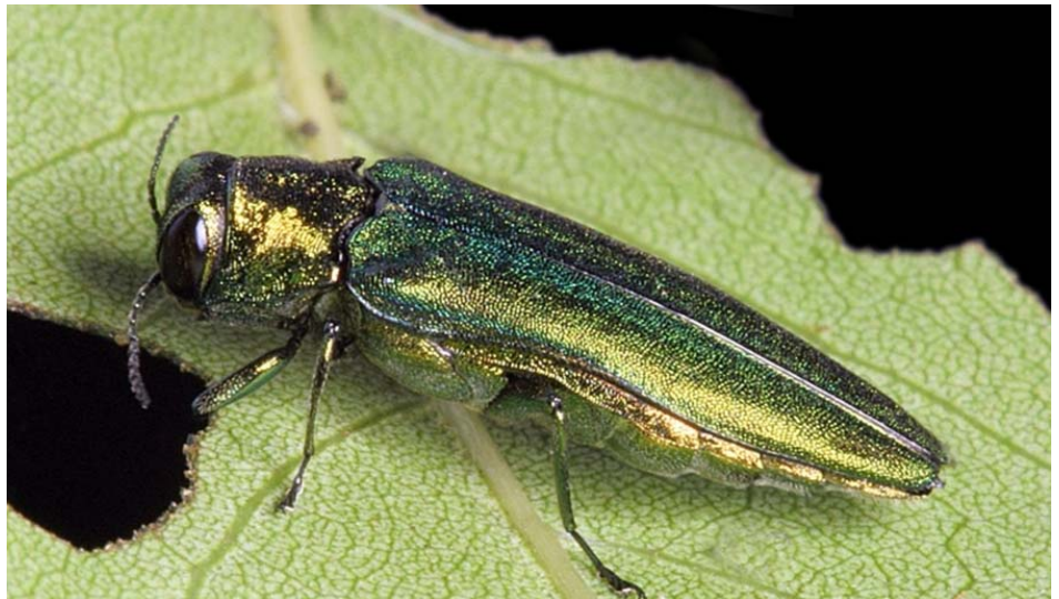
Fig. 1. Emerald ash borer adult.

EAB passes through four instars before pupating near the bark and emerging as an adult. The larvae are creamy white, and dorso-ventrally flattened. As they feed on the cambium layer or vascular system of the plant, they create long serpentine galleries filled with