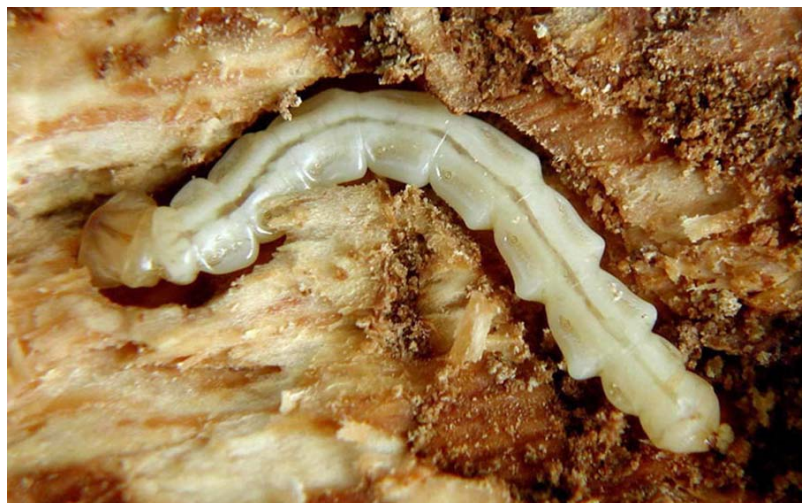
Fig. 2. Emerald ash borer larva.