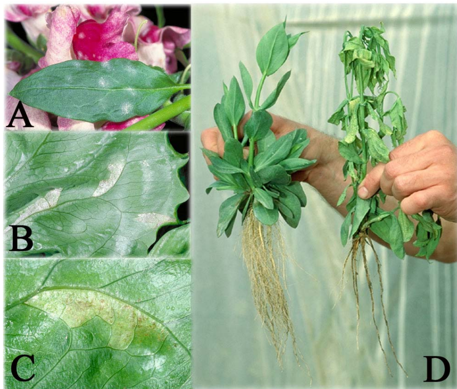
Fig. 1. White hairlike mycelium and spores of powdery mildew on snapdragon leaves, flowers and stems (A); downy mildew spores on the underside of a leaf (B) with corresponding areas of yellowing and browning on the upper surface (C); and yellowing and wilting resulting from diseased roots, brown in color, with poor branching compared to healthy lisianthus plant (D).

Bacteria represent only 5% to 10% of plant disease issues and are relatively rare in outdoor settings in California due to generally low humidity levels, except in coastal regions. However, humidity levels in green-