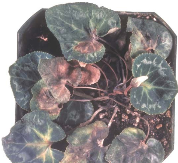
Symptoms of Fusarium wilt on cyclamen.

There are no fungicides that are really effective for Fusarium wilt diseases caused by soil-inhabiting, host-specific forms of Fusarium oxysporum . You might see “Fusarium” on a chemical label, but the primary fungicide activity is usually on other soil-borne or foliar Fusarium species, not Fusarium oxysporum . I recall when Bayleton became available over 20 years ago, a carnation grower misinterpreted the “Fusarium” listing on the product label and drenched the fungicide into the soil to attempt to manage Fusarium wilt. Unfortunately, at the rate applied, it had a fairly strong growth-regulating effect. Subsequent growth of the carnation stems had dramatically shortened internodes. It took months of growth to work out of the plant and soil, but eventually the crop began to produce normal-length cut flowers.